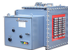
ON LOAD TAP CHANGERS – 11kV (OLTC)