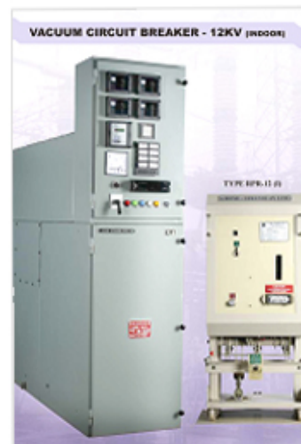
VACUUM CIRCUIT BREAKER - 12KV (INDOOR) TYPE VCB-11 (II)