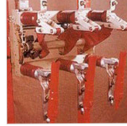
Off Load Isolator