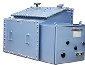
ON LOAD TAP CHANGERS – 33kV (OLTC)