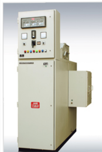
11kV Indoor VCB Panel