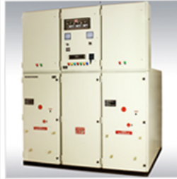
Ring Main Gear