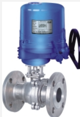
Motorised Butterfly Valves