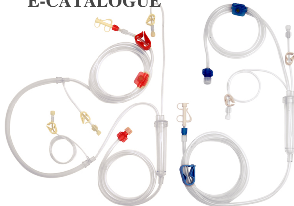
Haemo-o-line Blood Lines