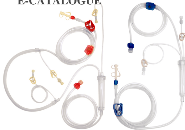
Haemo-o-line Blood Lines