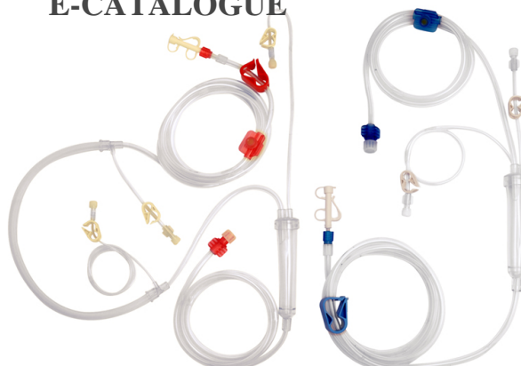
Haemo-o-line Blood Lines