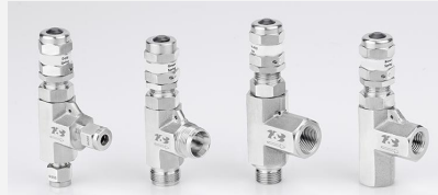
SAFTEY RELIEF VALVE