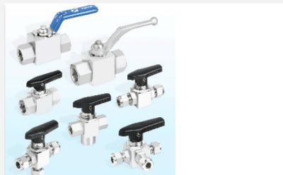
BALL VALVES (2-WAY / 3-WAY)