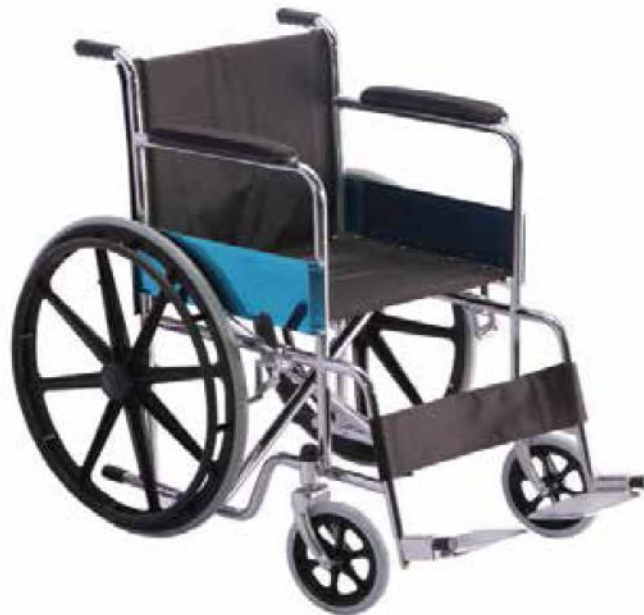
FOLDABLE WHEEL CHAIR