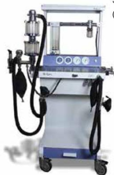
ANESTHESIA MACHINE (PEDIAS – C)

Size: 1500 mm * 740 mm* 700 mm (H * W* D)