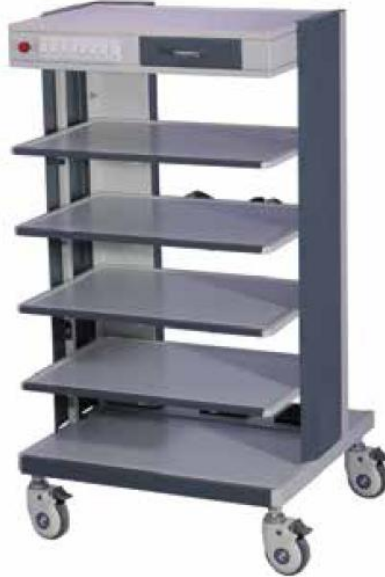
Approximate Dimension: 32"L x29"Bx58"H