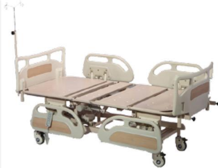
Approximate Dimension: 82" L X 38" B X 20"- 29" H (in inches)