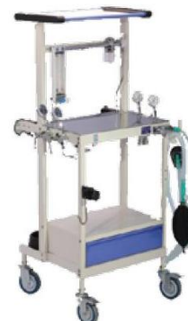
ANESTHESIA MACHINE (BASIC) MF 63