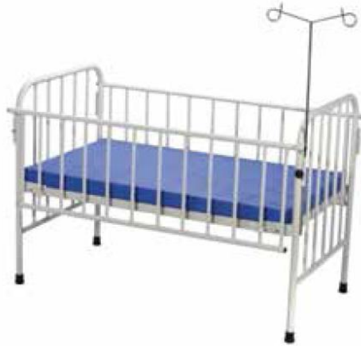
Approximate Dimension: 54" L X 30" B X 20" H in inches