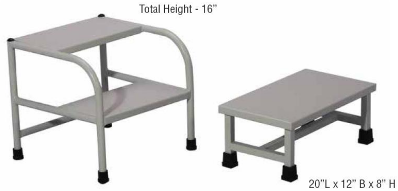
Approximate Dimension: Size: 18"x9"x8" for first step, 8" for the second step.