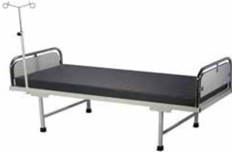
Approximate Dimension: 78" L X 35" B X 20" H in inches