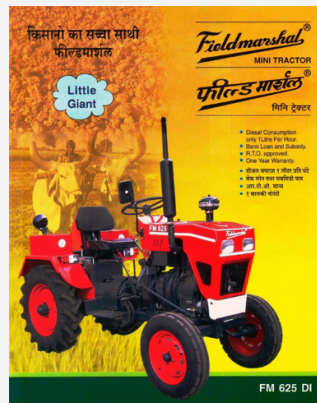
End Use Sectors Product Images