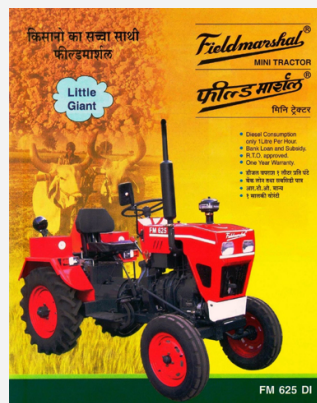
End Use Sectors Product Images