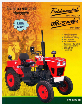
End Use Sectors Product Images