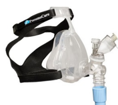
Easy2Neb™ Vibrating Mesh Nebulizer