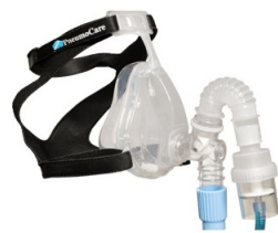
Easy2Neb™ Jet Nebulizer